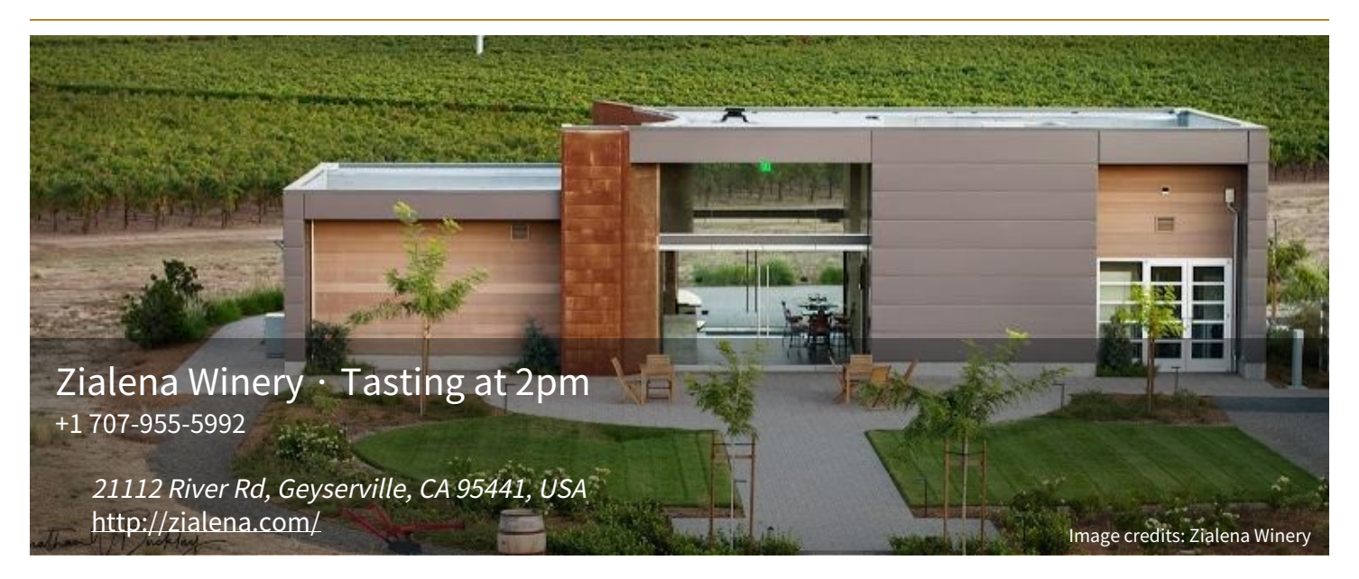
Start Time 2:00 PM