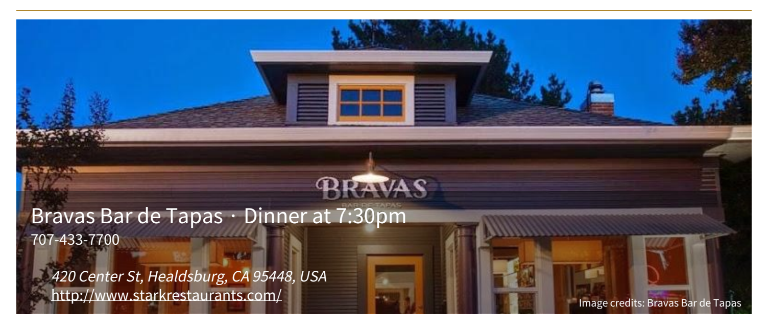
Start Time 7:30 PM