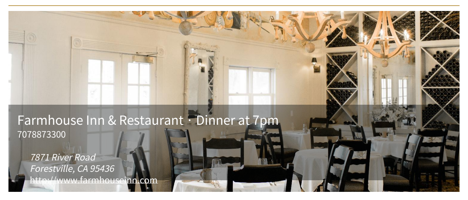
Start Time 7:00 PM