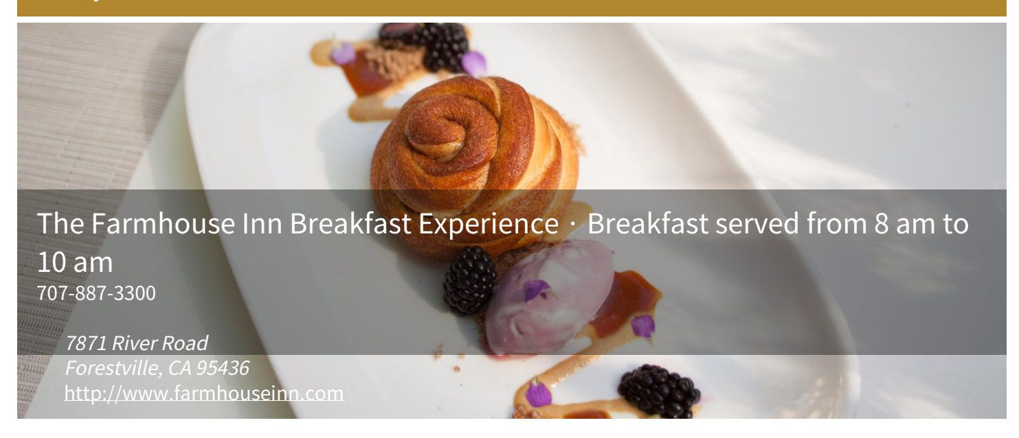
Start Time 8:00 AM