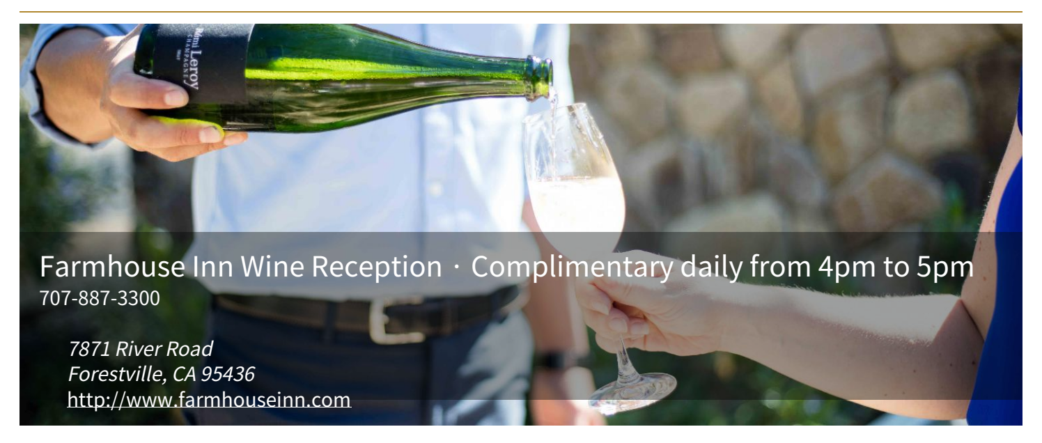
Start Time 4:00 PM