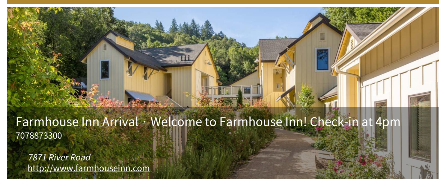
Start Time 4:00 PM