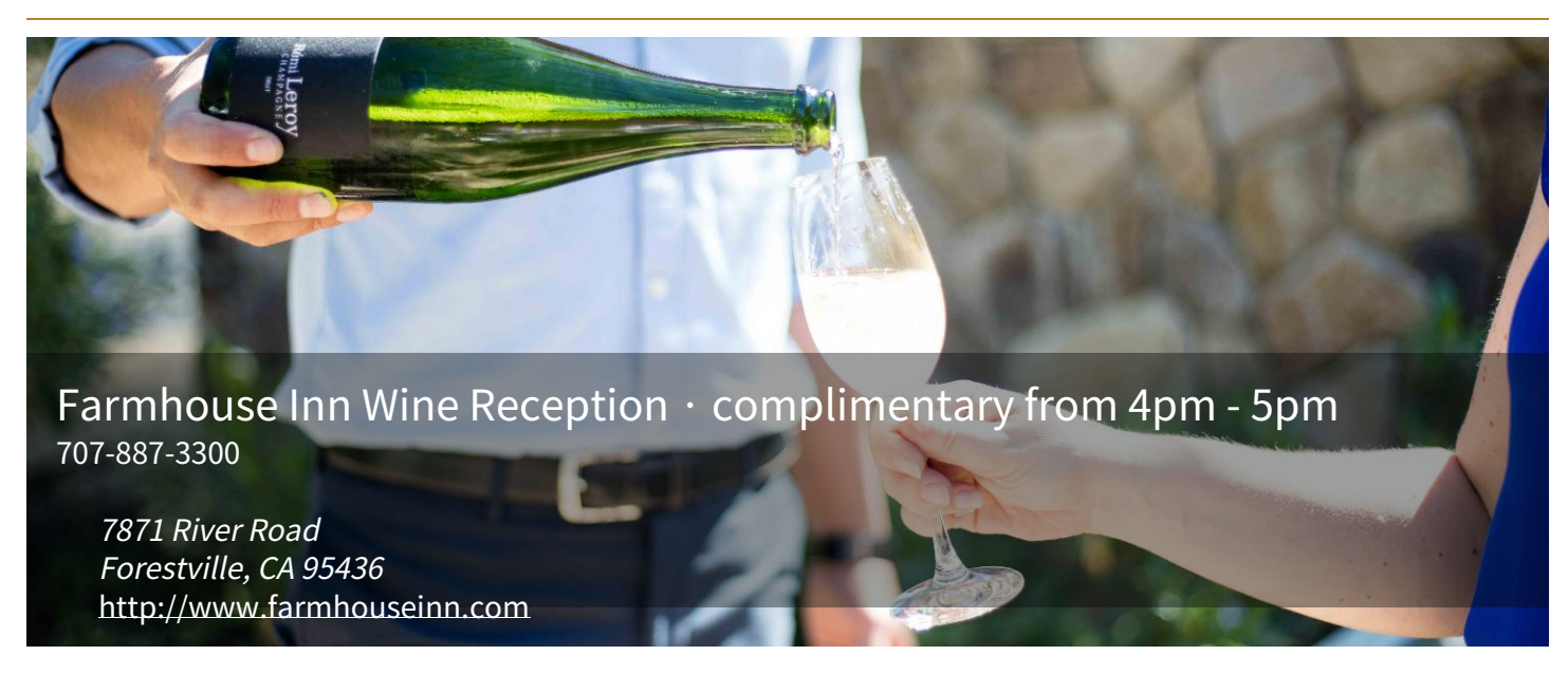
Start Time 4:00 PM