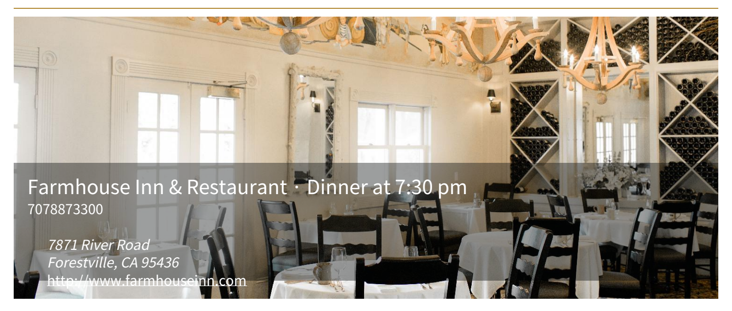
Start Time 7:30 PM