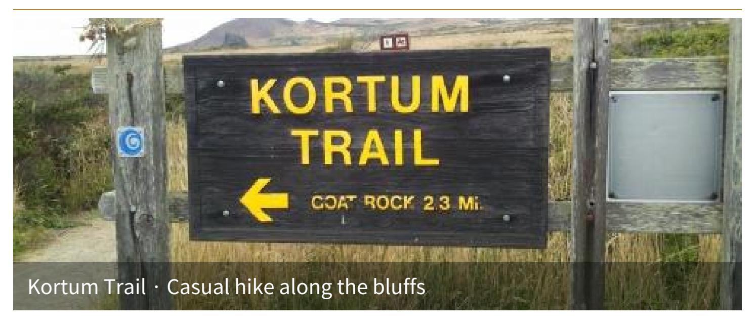
Start Time 11:00 AM