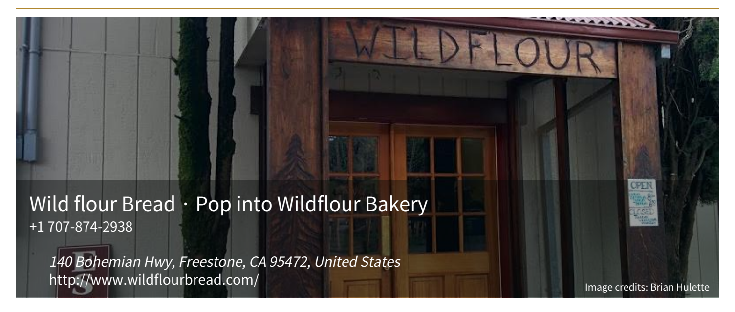
Start Time 2:00 PM