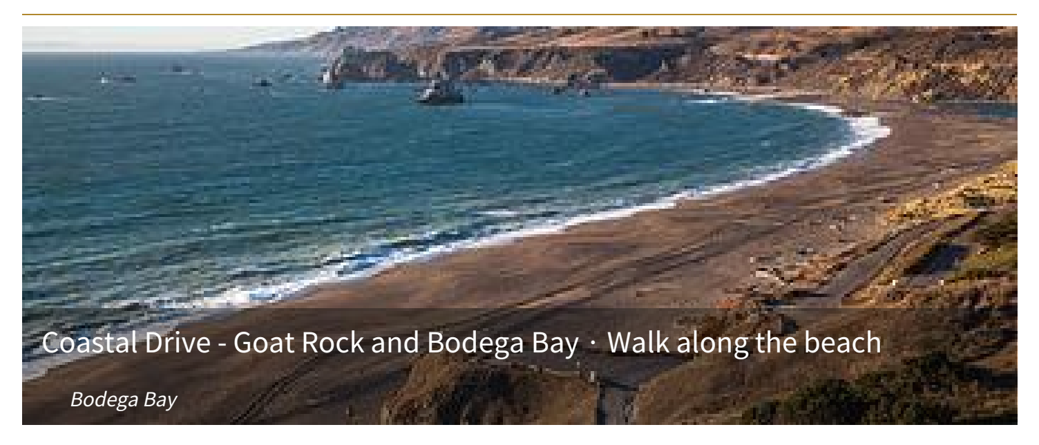
Start Time 10:00 AM